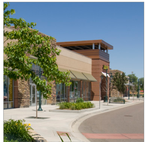
Arvada Ridge Market Place

For more information about Arvada Ridge Market Place or any of our outstanding properties, visit SheaProperties.com .