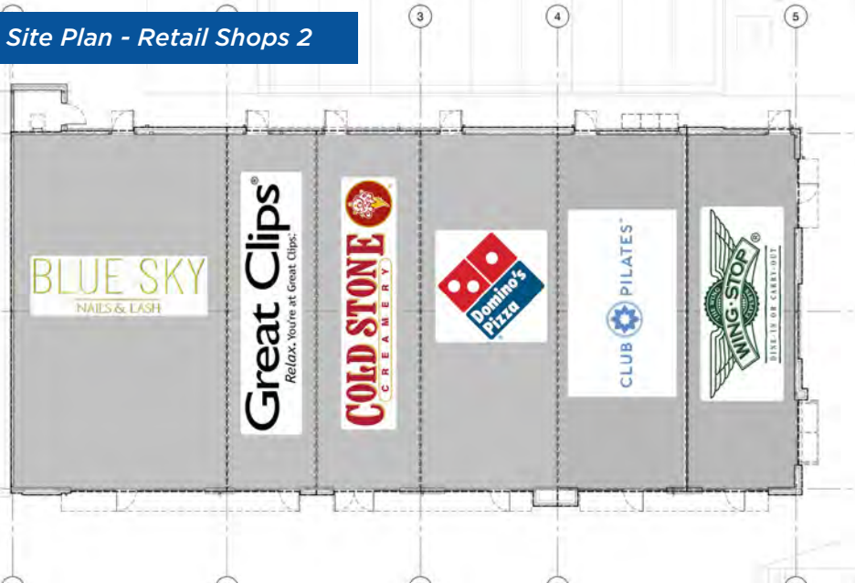
Site Plan - Retail Shops 2