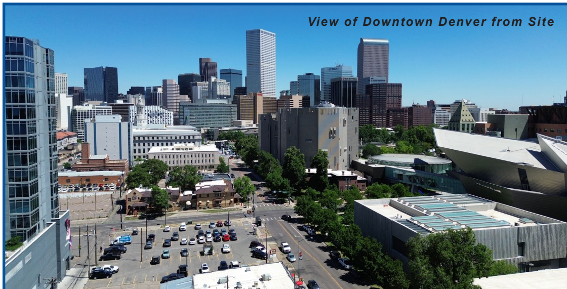
View of Downtown Denver from Site