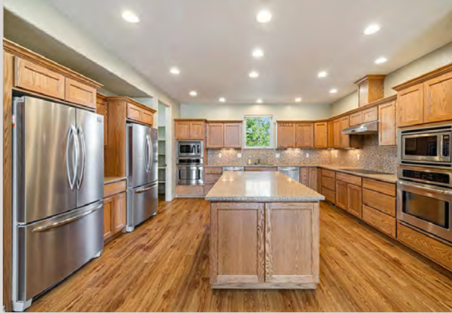
Kitchen / Great Room